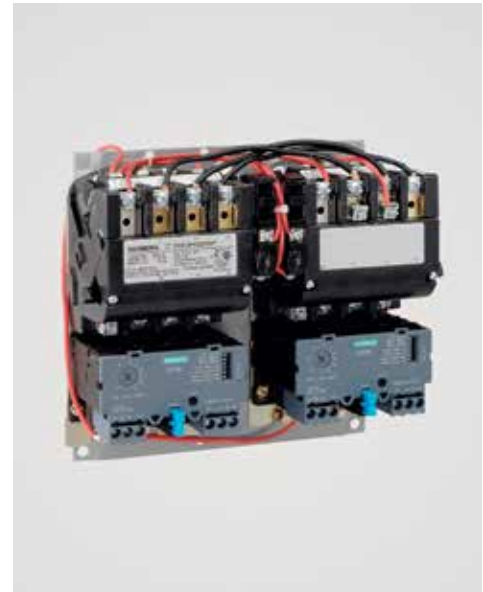
Two-Speed Reversing Starter with ESP200 Solid-State Overload Relay – Class 30

This versatile line offers a motor starter for every application you may have. Siemens offers full or reduced voltage NEMA starters with solid-state electronic or bimetal overload protection, single-speed or two-speed, reversing or non-reversing, single-phase or three-phase, in full and half sizes 00-8. From fractional horsepower to large 900 HP motors, Siemens NEMA starters are the right choice for demanding applications. All starters are UL listed and CSA certified.