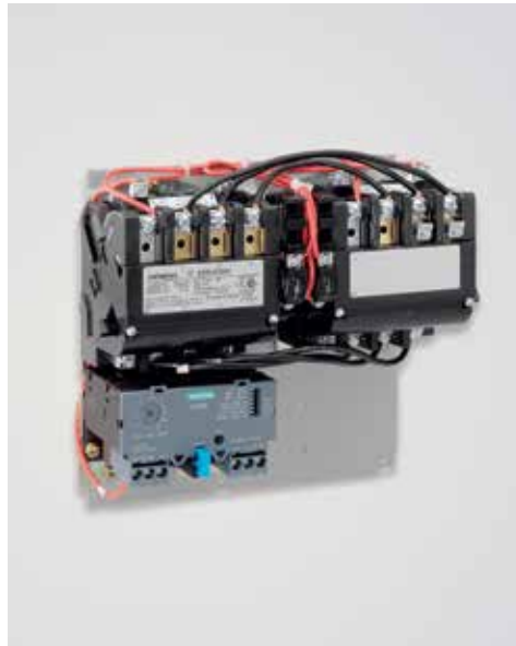
Reversing Starter with ESP200 Solid-State Overload Relay – Class 22