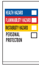
HMIG Color Bar