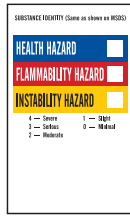
HMIG Color Bar